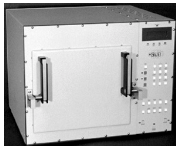
Figure 1-EC10 Sun Oven

The EC10 is provided for applications up to 300°C as specified under Reedholm P/N 70026. This oven is not customized for Reedholm use. Thus, Sun can assure temperature uniformity and oxygen concentration.