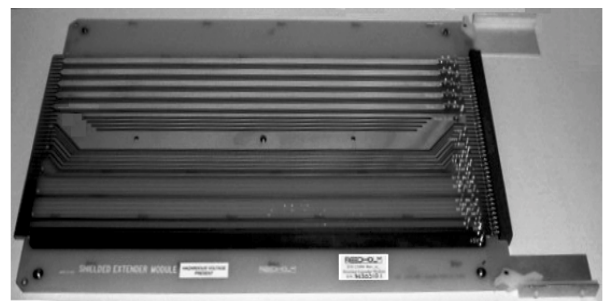
Figure 2 – Extender Board without Front Shield

Since the resistance contribution is so low, there is negligible effect on any application testing done with a module placed on an extender module.