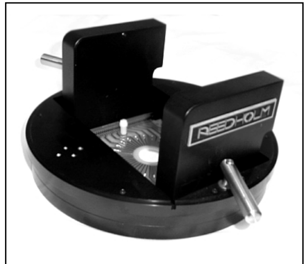
Figure 1 - PCIA Without Cabling

The Reedholm Probe Card Interface Assembly (PCIA) is a robust mechanical interface used to connect standard crosspoint matrix, or low current picoammeter matrix, pins to custom Reedholm probe cards. At the upper right is a photograph of the PCIA (sans cable). It fits into the same opening as the 9.5" RC-2 carrier ring used by most prober manufacturers for rectangular probe cards.